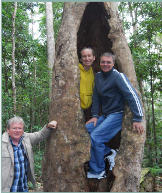
So they live in tree houses over here?

Hi. It was a great opportunity to visit Stepping Stone Clubhouse in Brisbane. Stepping Stone staff and members were awesome hosts and made us feel very welcome.