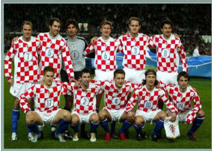
The amazing Croatian Football Team