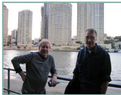
Hey, at least our Sky tower is higher.