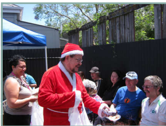
While the weather was far from North pole conditions, Santa made his obligatory appearance.