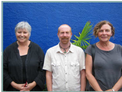
Some of our visitors: Friends from the Orkney Isles

The meeting itself was a fantastic opportunity to reflect on what we do. For the most part we all agreed that the unit does a great job for the Clubhouse. As we implement the changes from the meeting we will continue to grow and improve what we do.